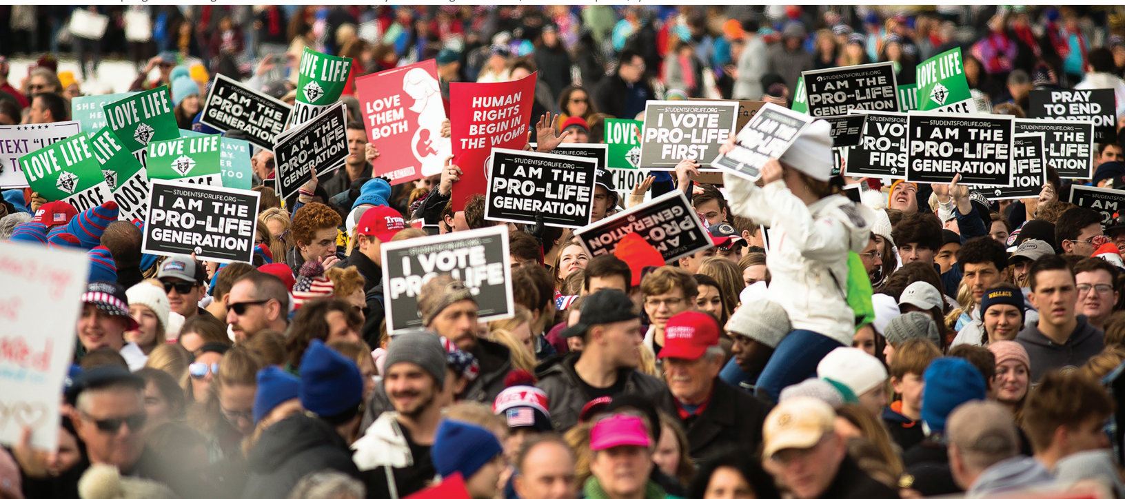
People gather during the annual March for Life rally in Washington Jan. 24, 2020.

The Spiritual Exercises and Ignatian discernment lie at the heart of the Jesuit mission. All our works are grounded in the Ignatian spiritual tradition and seek, in their own way, to show the way to God. As Pope Francis wrote in his letter confirming the UAPs, "Without this prayerful attitude, the other preferences will not bear fruit." So, prayerful contemplation of our context is where we start when we reflect on political participation from an Ignatian perspective.