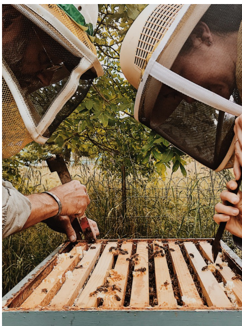
Beekeepers harvest honey at St. Leo's Parish in Tacoma, WA.

back over the past four years, “threatening the health of our communities, families and natural environment.” These protections are even more critical now, as studies have shown a direct link between air pollution and a higher death rate due to COVID-19 . Among the most vulnerable to the deterioration of our air and water are Environmental Justice communities , children and the elderly. To reduce harmful pollution and protect human health, we urge the EPA to: