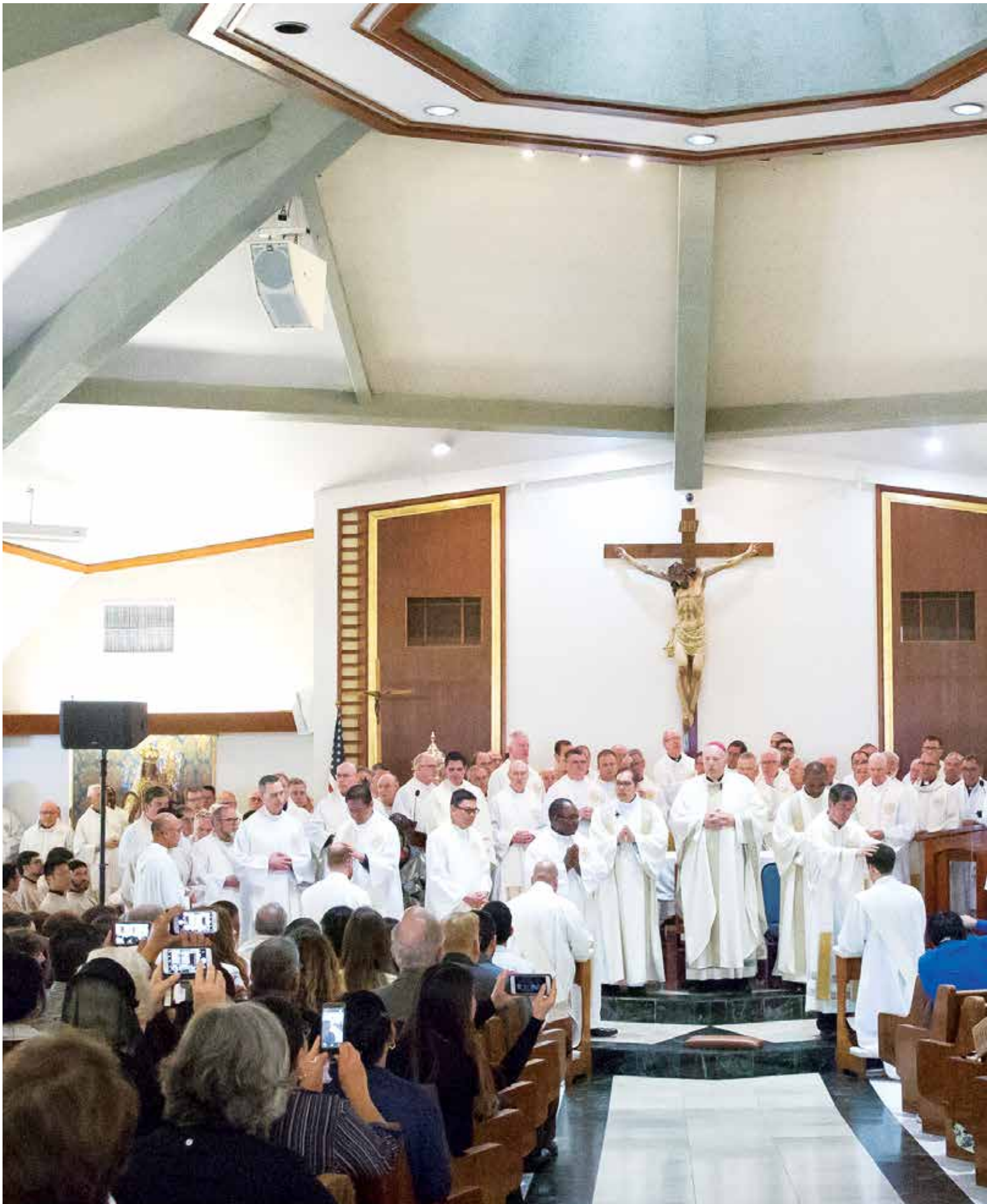
Ordination ceremony at Our Lady of Mount Carmel Church, San Ysidro, California.