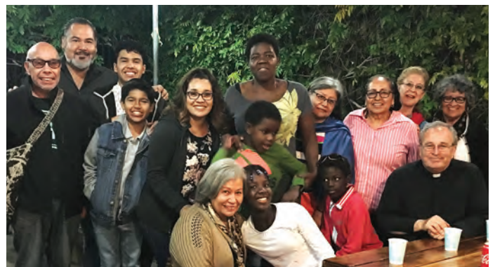
Our Lady of Guadalupe Parish in San Diego found housing for a migrant family from Haiti.

At the Province’s schools, students took up the call for solidarity through legislative meetings and letter writing campaigns. Over one hundred students at Seattle Prep signed letters urging their elected representatives to recognize the human dignity of immigrants, refugees and asylum seekers.