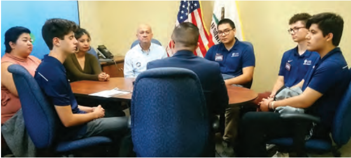
Loyola High School of Los Angeles students met with Congressman Jimmy Gomez, U.S. Representative for California's 34th congressional district.

In Los Angeles, a group of Loyola High School students who are directly impacted by immigration policies joined Proyecto Pastoral — a community building organization at the Jesuits' Dolores Mission Parish in Los Angeles — in a meeting with Congressman Jimmy Gomez to share their family stories.