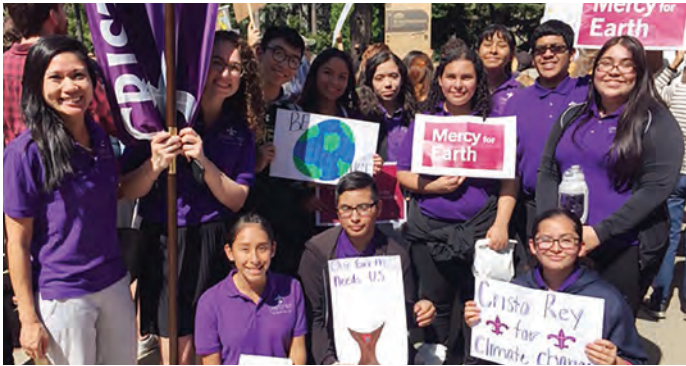
Students from Cristo Rey Sacramento participated in the Global Climate Strike.

September 20 marked the Global Climate Strike, and a number of Jesuits West schools took part in their respective cities. Schools participating included the University of San Francisco; Loyola Marymount University in Los Angeles; Loyola High School of Los Angeles; Cristo Rey High School Sacramento; Brophy College Preparatory in Phoenix; Seattle Preparatory School; Jesuit High School in Portland, Oregon; and Bellarmine Preparatory School in San Jose, California, among others.