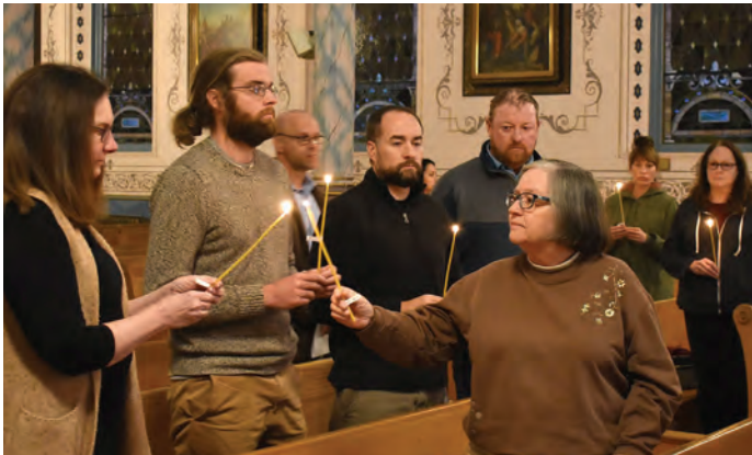
A prayer vigil for migrants at St. Francis Xavier Parish in Missoula, Montana.