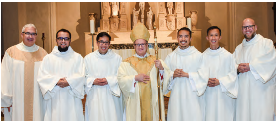
Five Jesuits were ordained to the diaconate on Oct. 19 in Moraga, California, including three from Jesuits West.

As deacons, they will continue their studies and be assigned to parishes until next summer when they will be ordained to the priesthood and receive their first missions as Jesuit priests.