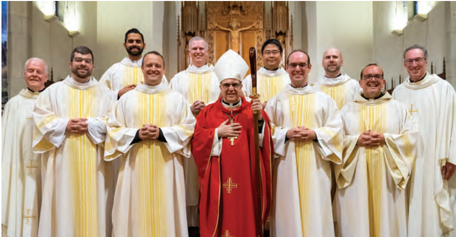
Eight Jesuits were ordained to the diaconate in Boston Sept. 21, including two from Jesuits West.

This fall, five Jesuits from our Province were ordained to the diaconate at two different Masses across the United States.