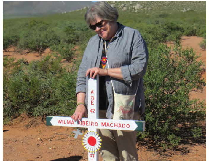
A participant on the immersion trip from St. Aloysius Parish in Spokane places a cross in memory of a migrant who died during the journey through the Sonoran Desert.

Other parishes also took action. Members of St. Francis Xavier Parish in Missoula, Montana, gathered at a vigil to pray for migrants in October. Parishioners from St. Ignatius Church in Portland met with Senator Ron Wyden’s field manager, joined by two seniors from St. Mary’s Academy and one senior from Jesuit High who were interning at the office and sat in on the conversation.